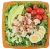
Cobb 600 Cal. ●

Hard Boiled Egg, Bacon, Avocado, Tomatoes, Blue Cheese Crumbles, Green Onions, Romaine, Mixed Greens, Chicken or Tofu Creamy Blue Cheese Dressing 130 Cal. ● Ranch Dressing available 90 Cal. ●