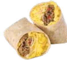
Turkey Sausage, Egg, & Cheese 520 Cal.