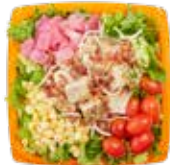
Jalapeño Ranch 540 Cal. ●

Carrots, Celery, Jalapeños, Tomatoes, Croutons, Romaine, Buffalo Chicken Creamy Blue Cheese Dressing 130 Cal. ●