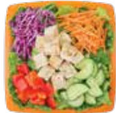
Thai 230 Cal. ●●

Corn, Tomatoes, Pickled Red Onions, Bacon, Pepper Jack Cheese, Romaine, Mixed Greens, Chicken or Tofu Jalapeño Ranch Dressing 80 Cal. ●