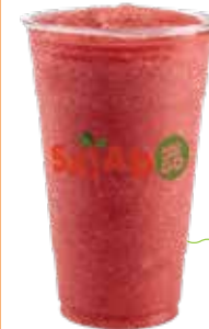
Frozen Strawberry Lemonade 24oz. 290 Cal.