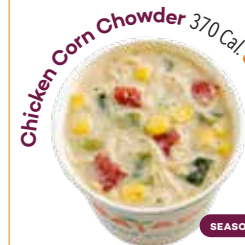
Chicken Corn Chowder 370 Cal. ●