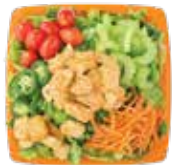
Buffalo Chicken 300 Cal.

Corn, Black Beans, Pico de Gallo, Avocado, Tortilla Strips, Pepper Jack Cheese, Romaine, Mixed Greens, Chicken or Tofu BBQ Ranch Dressing 60 Cal. ●