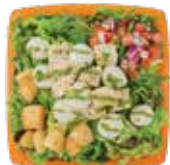
Caprese 440 Cal.

Tomatoes, Parmesan Cheese, Croutons, Romaine, Chicken or Tofu Caesar Dressing 120 Cal. ●