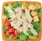
Caesar 300 Cal.

Dill Pickles, Tomatoes, Red Cabbage, Crispy Onions, Croutons, Romaine, Chicken or Tofu Thousand Island Dressing 116 Cal. ●●●