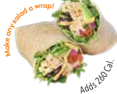
BBQ Ranch 640 Cal. ●

Cucumbers, Tomatoes, Kalamata Olives, Red Onions, Green Onions, Feta Cheese, Romaine, Mixed Greens, Chicken or Tofu Creamy Greek Dressing 80 Cal. ●