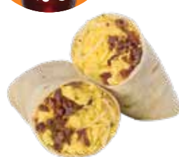
Bacon, Egg, & Cheese 600 Cal.