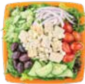
Greek 300 Cal. ●

Hard Boiled Egg, Bacon, Avocado, Tomatoes, Blue Cheese Crumbles, Green Onions, Romaine, Mixed Greens, Chicken or Tofu Creamy Blue Cheese Dressing 130 Cal. ● Ranch Dressing available 90 Cal. ●