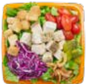
Summer Crunch 400 Cal. ●

Red Peppers, Carrots, Cucumber, Red Cabbage, Romaine, Chicken or Tofu Thai Peanut Dressing 130 Cal. ●●